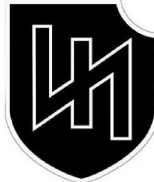
Emblem of the SS Division Das Reich.