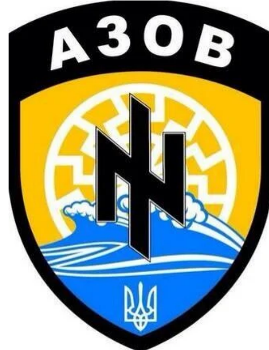
Emblem of the Azov Battalion formed by Kiev's junta.

"The Azov Battalion -which displays the Nazi SS emblem- (below left) is described by the Kiev regime as "a volunteer battalion of territorial defense". It's a National Guard battalion under the jurisdiction of the Ministry of Internal Affairs. Officially based in Berdyank on the Sea of Azov, it was formed by the regime to fight the opposition insurgency in Eastern and Southern Ukraine. It is also financed by the US administration." (Michel Chossudovsky, Ukraine's Kiev Regime is not "Officially" A Neo-Nazi Government, June 1, 2014)