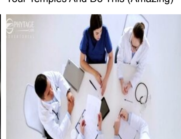
Use this "prostate shrinker" & empty your bladder entirely