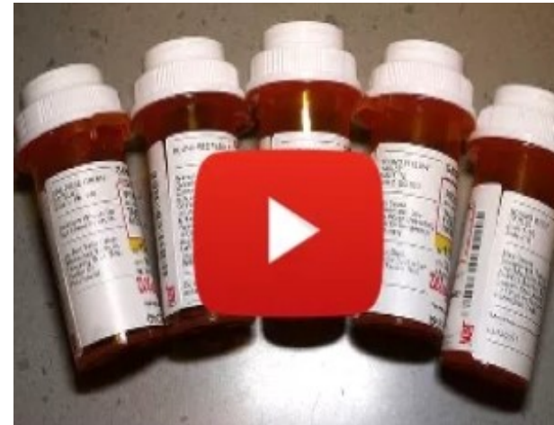
4 deadly blood pressure drugs