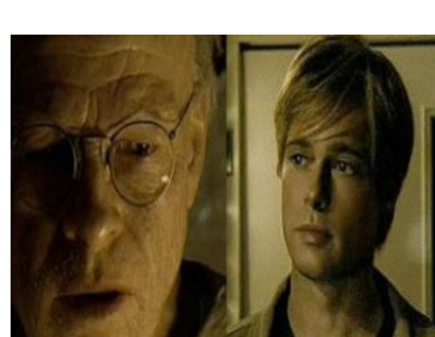
Live past 100?