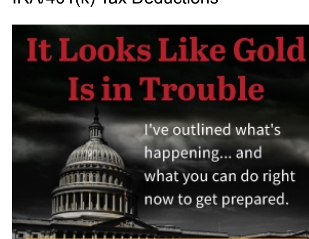
It Looks Like Gold Is In Trouble